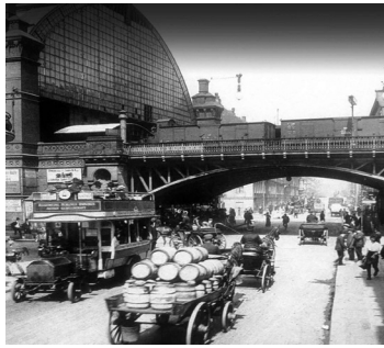
BERLIN: SYMPHONY OF A GREAT CITY